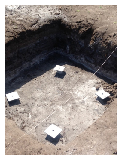
New Construction Plates installed to allow for pile and footing connection