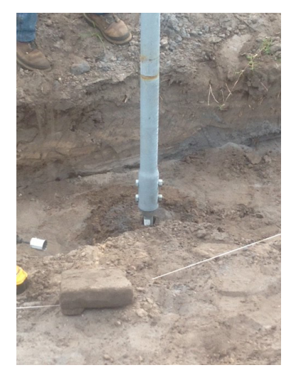
Square shaft to round connection