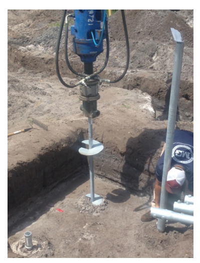
Square shaft lead section installation (back left) Round shaft extension bolted to lead section (right) Square shaft to round shaft transition fitting (front left)